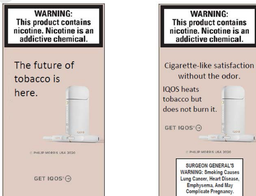
Figure 1b. Second ad design

ii. Quitting HWL message x Clear distancing from cigarettes ad message*