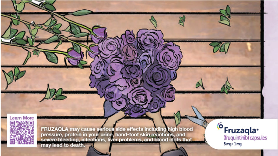
Frame 9 0:29-0:39

Video: Zooming effect continues, transitioning to an overhead shot of her filling a flower vase. Super: QR code and FRUZAQLA logo remain on screen. Bottom Super: FRUZAQLA may cause serious side effects including high blood pressure, protein in your urine, hand-foot skin reactions, and severe bleeding, infections, liver problems, and blood clots that may lead to death. Audio: FRUZAQLA may cause serious side effects including high blood pressure, protein in your urine, hand-foot skin reactions, and severe bleeding, infections, liver problems, and blood clots that may lead to death. SFX: Even lower level, but driving, soundtrack continues under major statement.