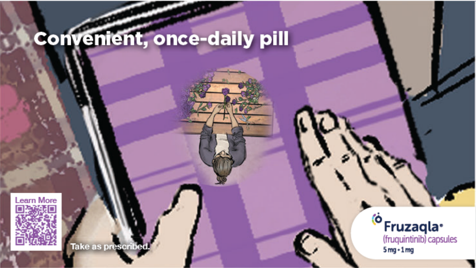
Frame 7 0:20-0:22

Video: Zooming effect continues as book lattice pattern image, from overhead, transitions into overhead scene (from a distance) of our flower shop character. Super: ON-SCREEN GRAPHIC [fades on and off]: Convenient, once-daily pill Super: QR code and FRUZAQLA logo remain on screen. Bottom Super: Take as prescribed. Audio: VO (narrator): And that is a convenient, once-daily pill. SFX: Low-level, but driving, soundtrack and VO continue.