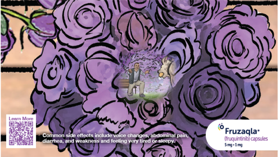
Frame 10 0:40-0:44

Video: Zooming effect continues, as we move toward and through one of the flowers in the vase. Zooming effect continues as that flower transitions to a grouping of flowers (from a distance) that are behind a park bench, where our man and his dog are visible. Super: QR code and FRUZAQLA logo remain on screen. Bottom Super: Common side effects include voice changes, abdominal pain, diarrhea, and weakness and feeling very tired or sleepy. Audio: VO (narrator): Common side effects include voice changes, abdominal pain, diarrhea, and weakness and feeling very tired or sleepy. SFX: Even lower level, but driving, soundtrack continues under major statement.