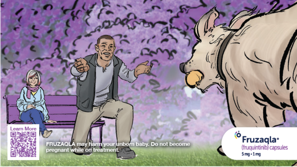
Frame 11 0:45-0:47

Video: Zooming effect continues as we move in closer on our man with his dog by the park bench with flowers behind it. Sitting on the park bench is his wife and care partner. Super: QR code and FRUZAQLA logo remain on screen. Bottom Super: FRUZAQLA may harm your unborn baby. Do not become pregnant while on treatment. Audio: VO (narrator): FRUZAQLA may harm your unborn baby. Do not become pregnant while on treatment. SFX: Even lower level, but driving, soundtrack continues under major statement.