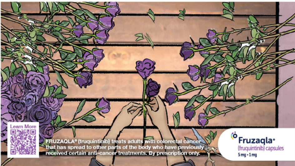
Frame 8 0:23-0:28

Video: Zooming effect continues as we move in closer, from overhead, and see our flower shop character working with the flowers. Super: QR code and FRUZAQLA logo remain on screen. Bottom Super: FRUZAQLA® (fruquintinib) treats adults with colorectal cancer that has spread to other parts of the body who have previously received certain anti-cancer treatments. By prescription only. Audio: VO (narrator): FRUZAQLA® (fruquintinib) treats adults with colorectal cancer that has spread to other parts of the body who have previously received certain anti-cancer treatments. SFX: Even lower level, but driving, soundtrack continues under major statement.