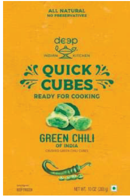
Q.C.Green Chilli 283g : 25020,25021.