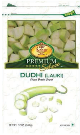
Dudhi Diced 340g : 25042,25077,25146.