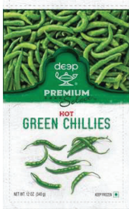
Green Chilli(Hot)340g : 25008,25031,25038.