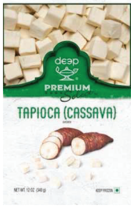
Tapioca Diced 340g : 24354,25023,25045,25071,25086,25095,25142.