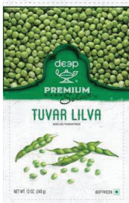
Tugar Lilva 340g : 24362,24363,24365,24366,25003,25007,25009,25010,