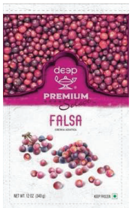
Falsa 340gm : 25004,25034,25049,25121,25143,25150,25171, 25185.