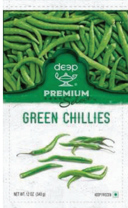
Green Chilli 340g : 24355,25010,25045.