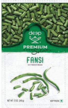
Fansi 340g : 24358,25018.