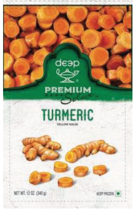
Tur.Yellow Haldi 340g : 25027,25041,25065,25106,25142,25156.