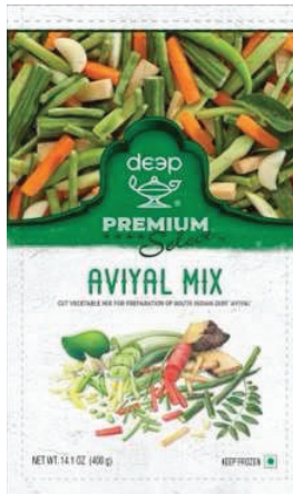
Avial Mix 400gm : 24354,25009,25046,25065.