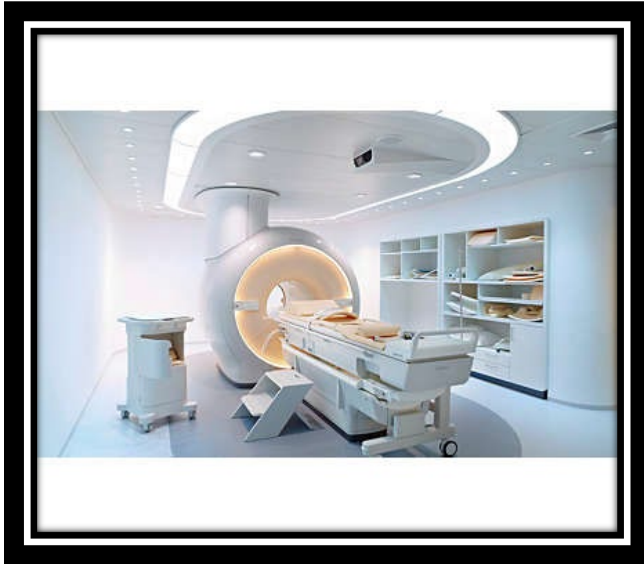
Figure 1: Sonalleve MR-HIFU System

The Sonalleve MR-HIFU Therapy system consists of the following main components: