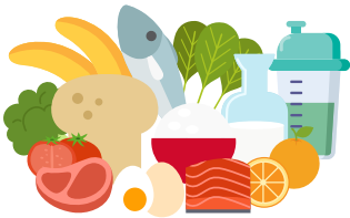
Cucuklirluten assilrianeq neqnek cali mernek