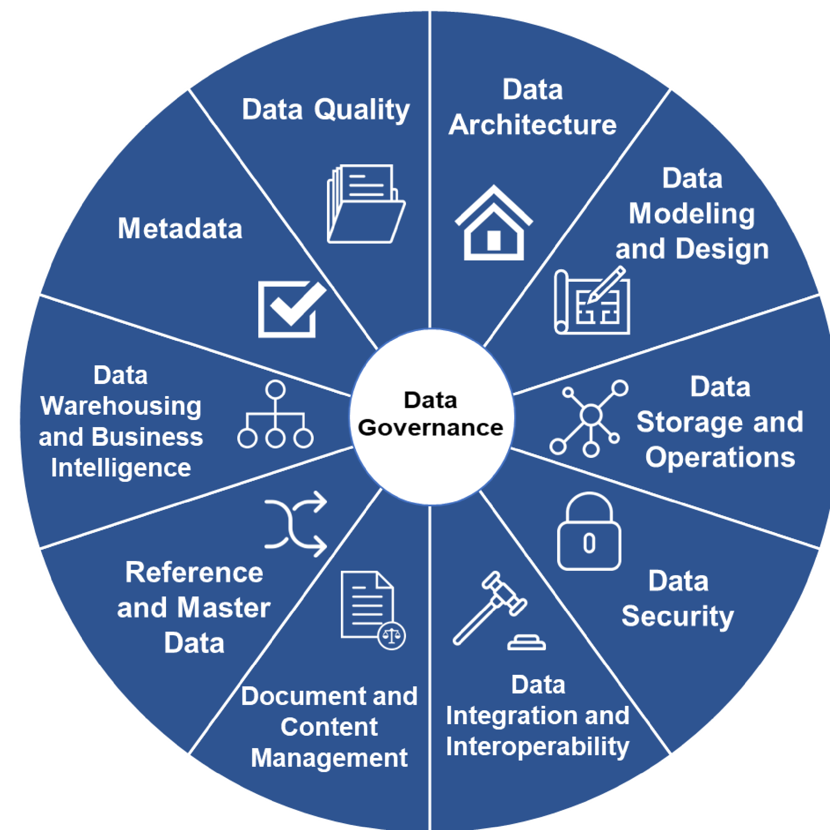
Figure 1. DAMA-DMBOK2 Data Governance Framework