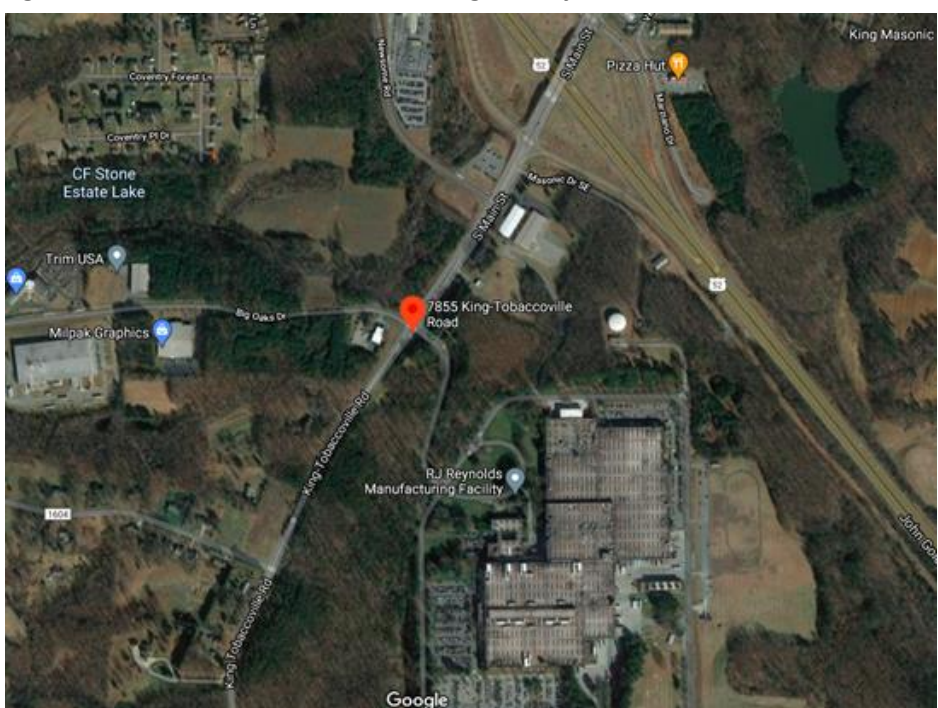
Figure 1. Location of the Manufacturing Facility<sup>1</sup>

The affected environment includes human and natural environments surrounding the facility. The new products would be manufactured at the address listed in section 1 of this document (Figure 1).