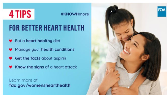
Click image to download.