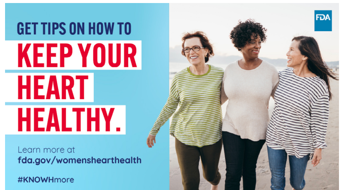
Click image to download.