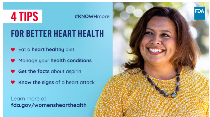
Click image to download.