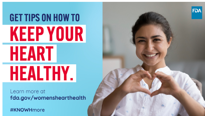
Click image to download.