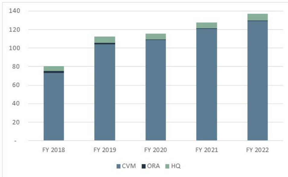
Exhibit 6: Historical Total Process FTE Levels by FDA Organization

Exhibit 6 provides the historical trend of total Process FTE levels for AGDUFA across CVM, ORA, and HQ for the past 5 fiscal years. AGDUFA III allowed for a significant increase in FTEs beginning in FY 2019 to support reduced review time performance goals. As the workload has continued to increase, additional FTEs have been supporting the generic premarket review program, resulting in an increase in CVM's FTEs in FY 2021 and FY 2022.