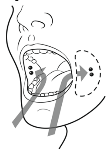
2 pills between cheek and gum on left side + 2 pills between cheek and gum on right side

Patients taking Mifepristone tablets, 200 mg must take misoprostol within 24 to 48 hours after taking Mifepristone. The effectiveness of the regimen may be lower if misoprostol is administered less than 24 hours or more than 48 hours after mifepristone administration.