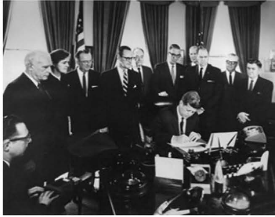
President Kennedy signing the 1962 amendments.