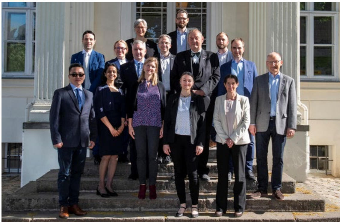
FDA officials recently held productive talks in Berlin with representatives from counterpart agency the German Federal Institute for Risk Assessment. The meeting was held to launch the MOU signed by the two agencies last year.

Considered to be the FDA's "sister agency" in Germany, the BfR is a scientifically independent institution within the Federal Ministry of Food and Agriculture in Germany. The BfR advises both the German federal government and states on questions of food, chemicals, and product safety, while conducting independent research on topics closely linked to the agency's assessment tasks.