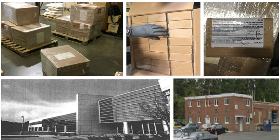
Images from Operation Lascar. Top row: example of transshipped product in the U.K. made ready to ship to the U.S. Bottom row: (left) how one such player advertised themselves; (right) what they really looked like.

At the time, many of the illicit medications (including counterfeit products), were intended to treat serious and life-threatening conditions, such as various forms of cancer, and required strict temperature controls to be administered safely. Further, the underlying distribution model had changed from direct-to-consumer sales to one which sought to penetrate the FDA-regulated pharmaceutical supply chain with targeted sales to physicians. In turn, these products were being administered to unsuspecting patients who were unaware these products were being obtained from unauthorized foreign sources and being shipped and stored outside of approved conditions.