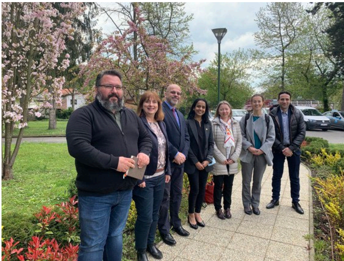
FDA Europe Office staff members with their Croatian regulatory counterparts.