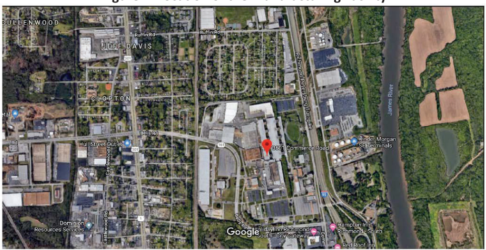
Figure 1. Location of the Manufacturing Facility

The new and predicate products are manufactured at 3601 Commerce Road, Richmond, VA (Figure 1).