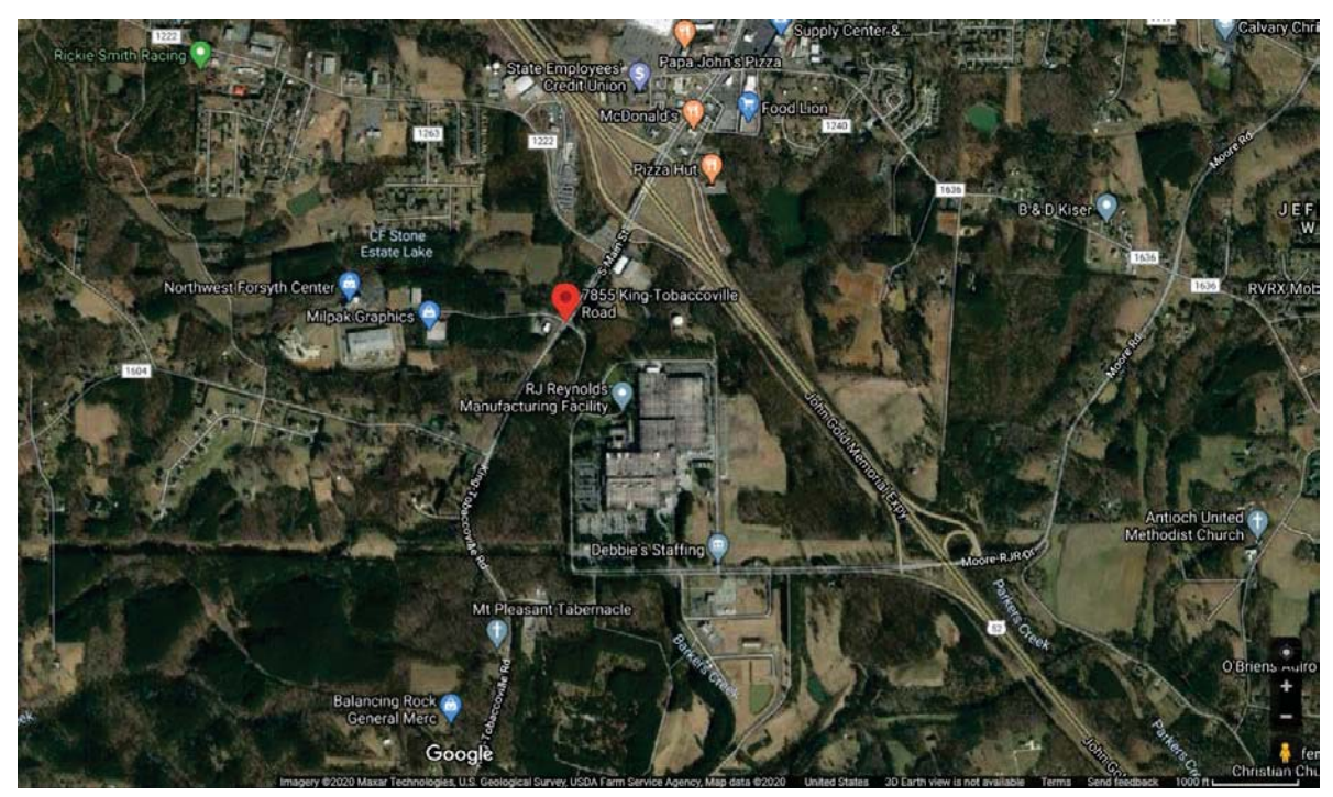
Figure 1. Location of the Manufacturing Facility<sup>1</sup>

The affected environment includes human and natural environments surrounding the manufacturing facility. The new product would be manufactured at the address listed in section 1 of this document (Figure 1).