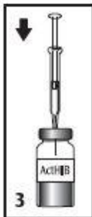
Figure 3 Insert the syringe needle through the stopper of the vial of lyophilized ActHIB vaccine component and inject the liquid into the vial.