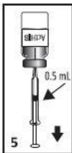
Figure 5 After reconstitution, immediately withdraw 0.5 mL of Pentacel vaccine and administer intramuscularly. Pentacel vaccine should be used immediately after reconstitution.