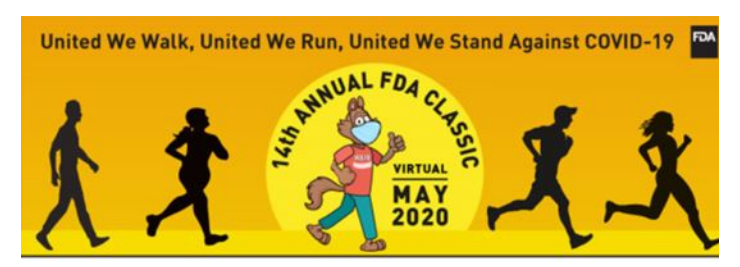
The 14th Annual FDA Classic: "United We Walk, United We Run, United We Stand Against COVID-19," was well received with 5,343 participants. Thank you for joining your colleagues!