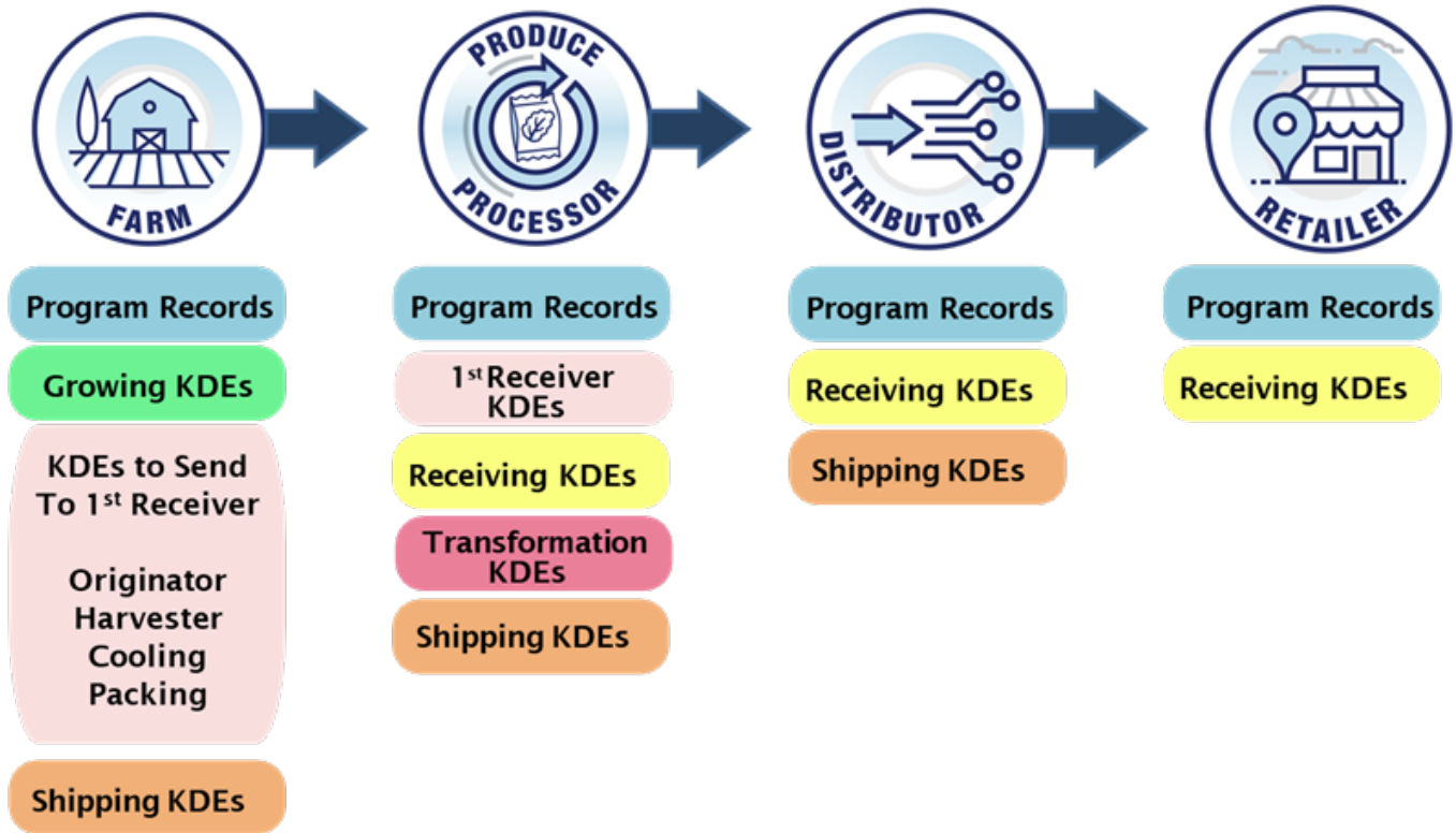
Diagram 1.b: Example of Required Records for Salad Kit Supply Chain

Diagram 1.b provides a quick snapshot of the records that the proposed rule would require -- including Traceability Program Records and records relating to critical tracking events (CTEs) -- for each supply chain participant.