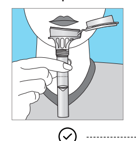
Spit until the amount of saliva (not bubbles) reaches the fill line

IMPORTANT: Please wash and dry your hands thoroughly before collection. Do not remove the plastic funnel from the tube until you have collected the sample. Adults assisting collection from children should perform all downstream steps after saliva collection.