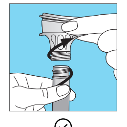
Unscrew the funnel from the tube and discard the funnel