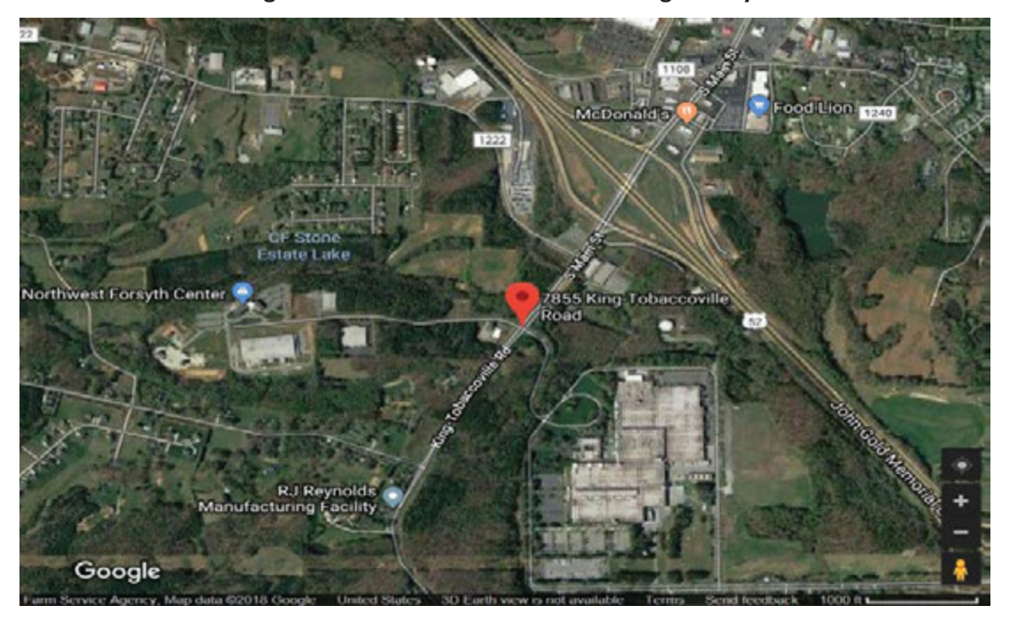
Figure 1. Location of the Manufacturing Facility<sup>1</sup>

The affected environment includes human and natural environments surrounding the manufacturing facility. The new product would be manufactured at the address listed in section 1 of this document (Figure 1).