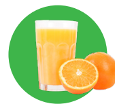
Oranges and orange juice