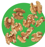
Nuts (such as walnuts)