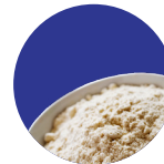
Fortified corn masa flour