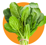
Dark leafy greens