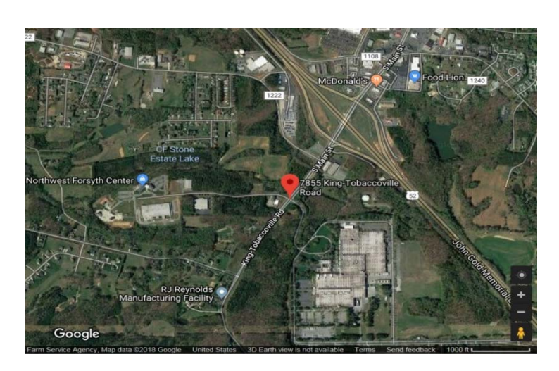
Figure 1. Location of the Manufacturing Facility

The new products would be manufactured at the address listed in section 1 of this document (Figure 1).