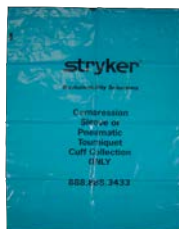
Two large teal collection bags

These materials are needed for one shipment.