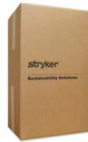
One large box