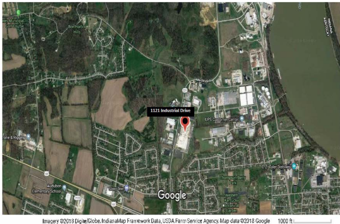
Figure 1. Location of the Manufacturing Facility

The affected environment includes human and natural environments surrounding the manufacturing facility. The new product is manufactured at Swedish Match North America LLC facility, at 1121 Industrial Drive, Owensboro, KY 42301 (Figure 1). 1 The facility is at the edge of a manufacturing district, with a power plant equipment fabricator and a beverage distributor to the north, a rubber products supplier and a steel fabricator to the east, a plastic fabrication company and a vending machine supplier to the west, a metal stamping facility to the southwest, and a housing development buffered by a row of trees to the south.