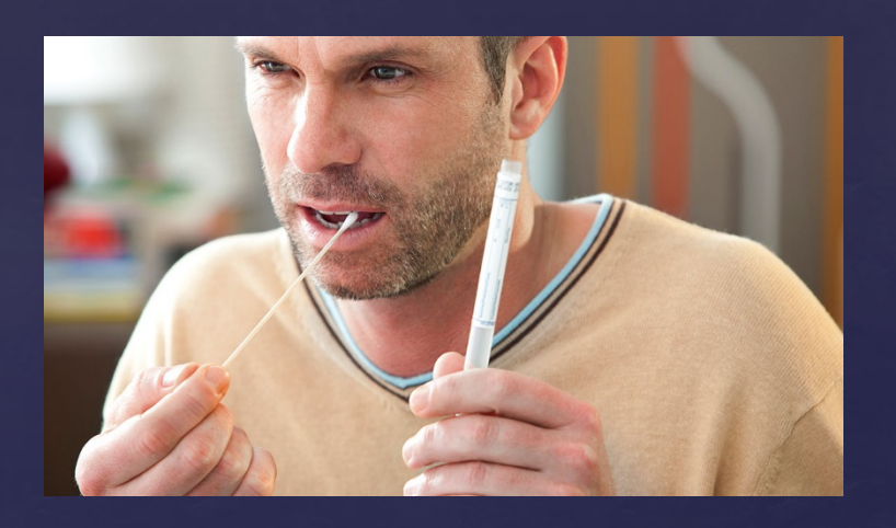
23and Me – Genetic Health Report