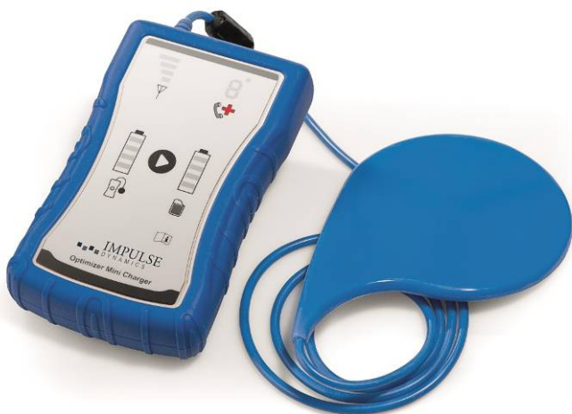
Figure 2: OPTIMIZER Mini Charger

The OPTIMIZER Mini Charger is also powered by a rechargeable battery. The charging wand is permanently attached to the device with a cable long enough to let you set up the charger up to almost 20 in away from you. The charging process runs automatically without requiring significant user intervention. Please refer to Section 7 of this manual for details on the proper operation of the charger.