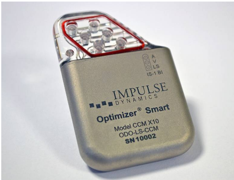
Figure 1: OPTIMIZER Smart IPG

The expected life of the OPTIMIZER Smart IPG is limited by the expected service life of its rechargeable battery. The rechargeable battery inside the OPTIMIZER Smart IPG should provide at least six years of service. Over time and with repeated charging, the battery in the OPTIMIZER Smart IPG will lose its ability to recover its full charge capacity.