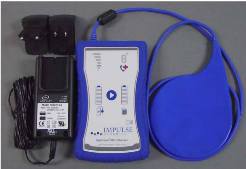
Figure 3: OPTIMIZER Mini Charger with Battery Charger and Plug Adapters