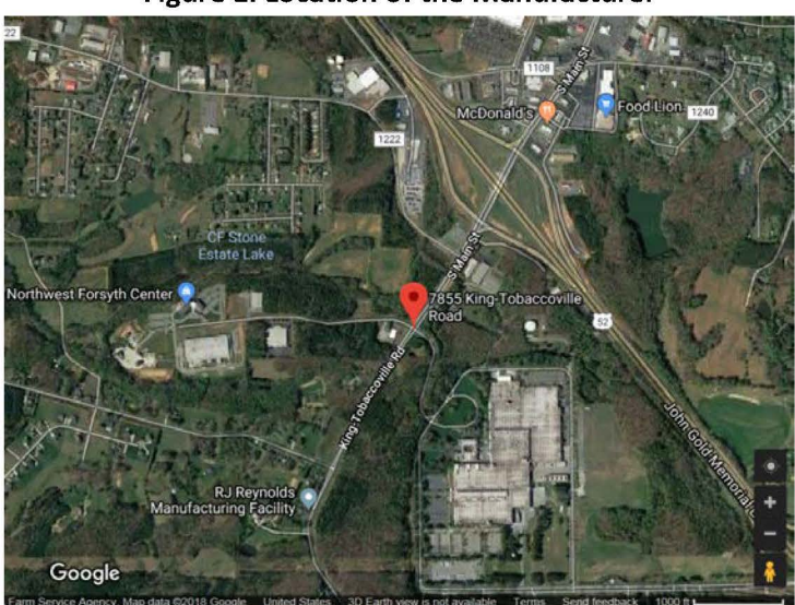
Figure 1. Location of the Manufacturer

The new products would be manufactured at the address listed in section 1 of this document (Figure 1).