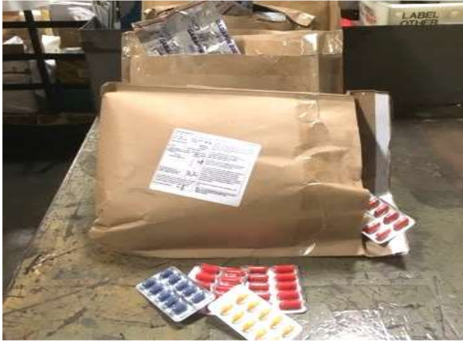
Repetitive bulk shipment from single supplier