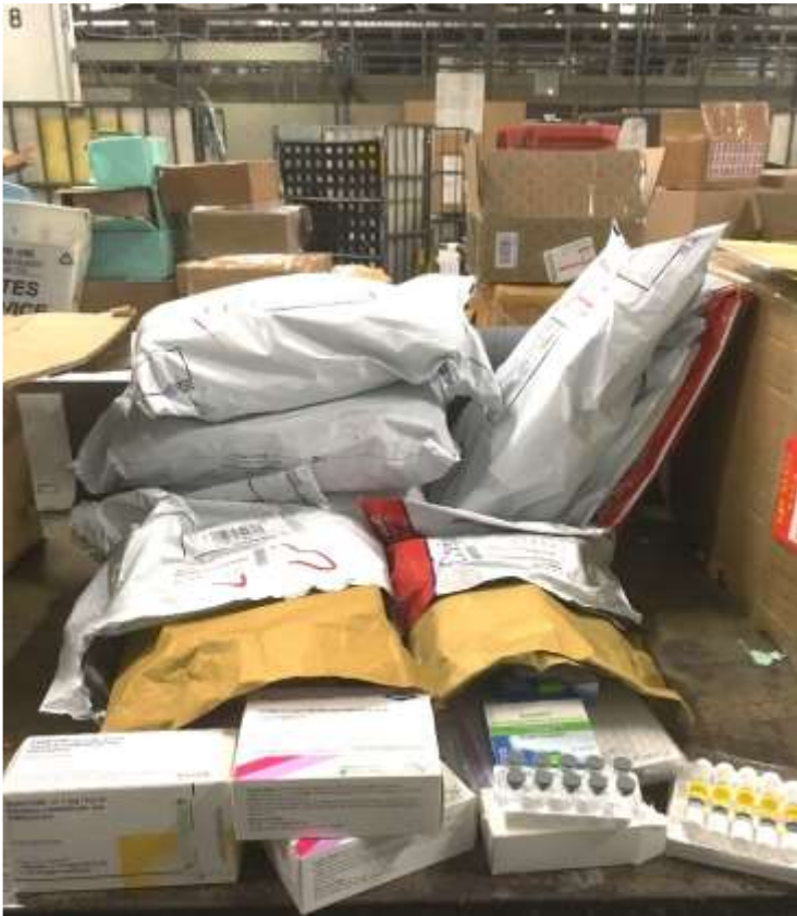
Hormones found at JFK IMF

The FDA has seen an increase of opioids illegally entering the country and is strengthening collaborative efforts with USPS, CBP and DEA to detect these opioids coming in through the mail. The FDA is also looking for ways in which information related to opioid interdictions can be used to better combat the smuggling of opioids.