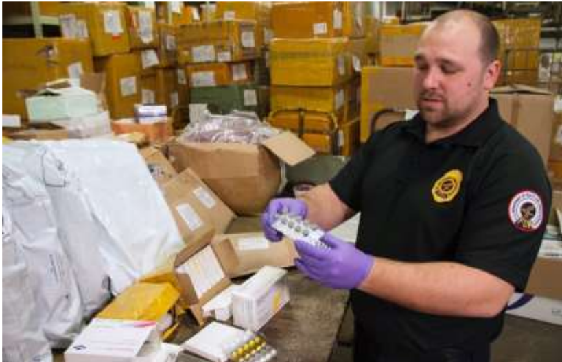
Hormones found at JFK IMF