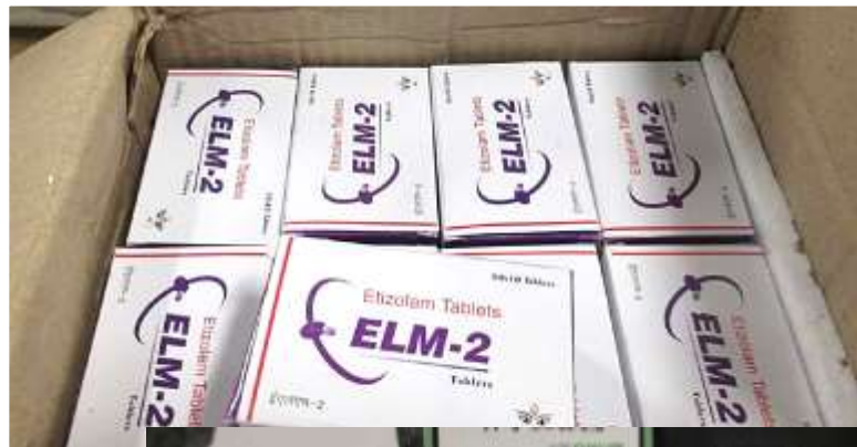
Foreign, unapproved anti-anxiety drug