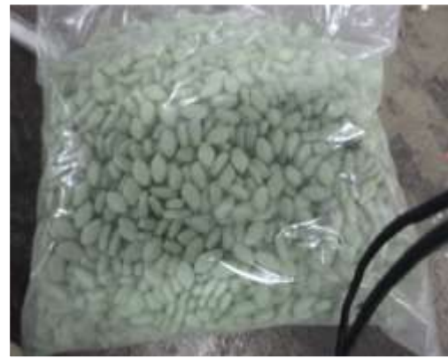
Unlabeled, unmarked pills