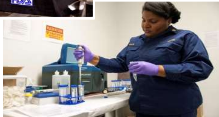
Testing a dietary supplement using a benchtop ion mobility spectrometer