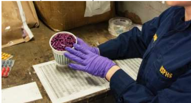
Unmarked, unlabeled capsules at JFK