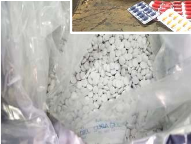
600,000+ pills found with no markings