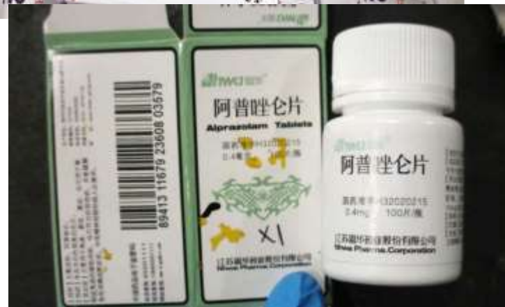
Foreign, unapproved, controlled substance