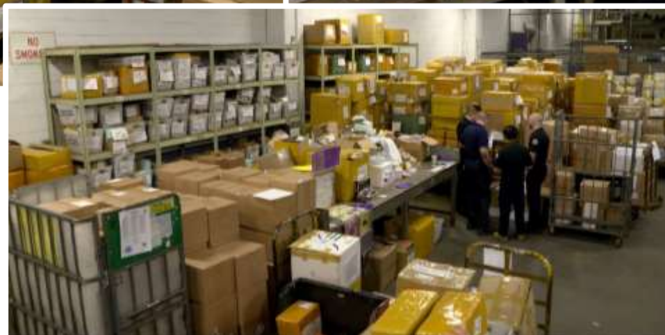
Packages for FDA review at JFK IMF