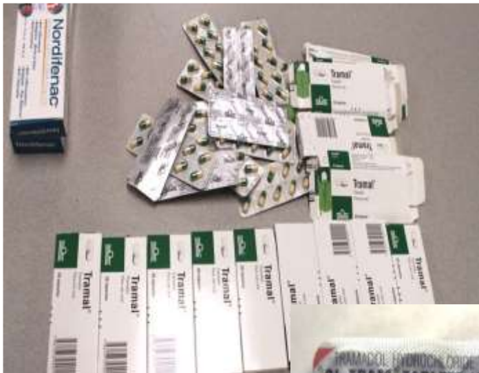
Foreign, unapproved version of tramadol

While CBP handles the majority of opioid interdictions within the IMFs, the FDA also encounters these products. When the FDA does find illegal opioids, it means that the agency is the final stop from preventing them from reaching consumers. Examples of opioids the FDA has found include tramadol, codeine and morphine.