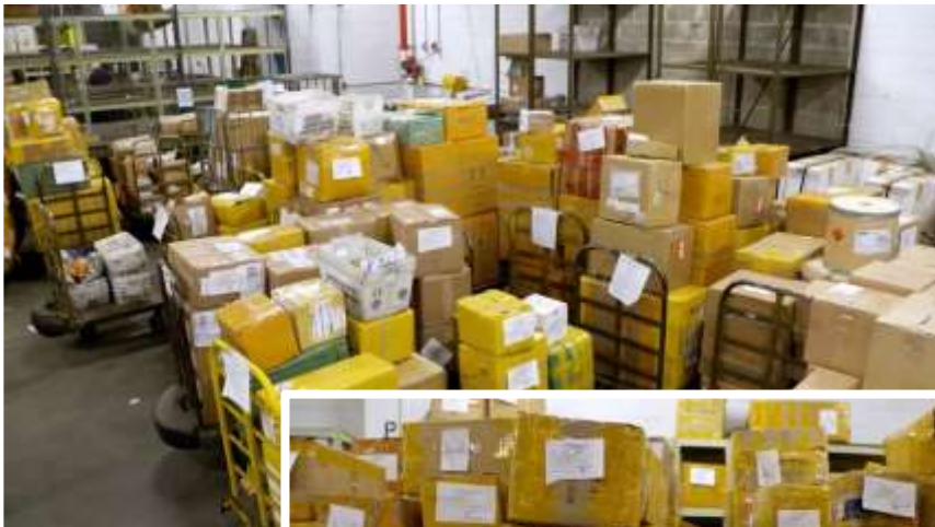
Packages for FDA review at JFK IMF

The IMFs receive international mail from more than 180 countries, which often lack advance information regarding the content of the packages that would aid in targeting shipments that are likely to contain illegal, unapproved, counterfeit and potentially dangerous drugs. How large is the scope of the problem? There’s no way for the FDA or any federal agency to know. But 87% of the packages that the FDA has reviewed contain illegal, unapproved, counterfeit and potentially dangerous drugs.