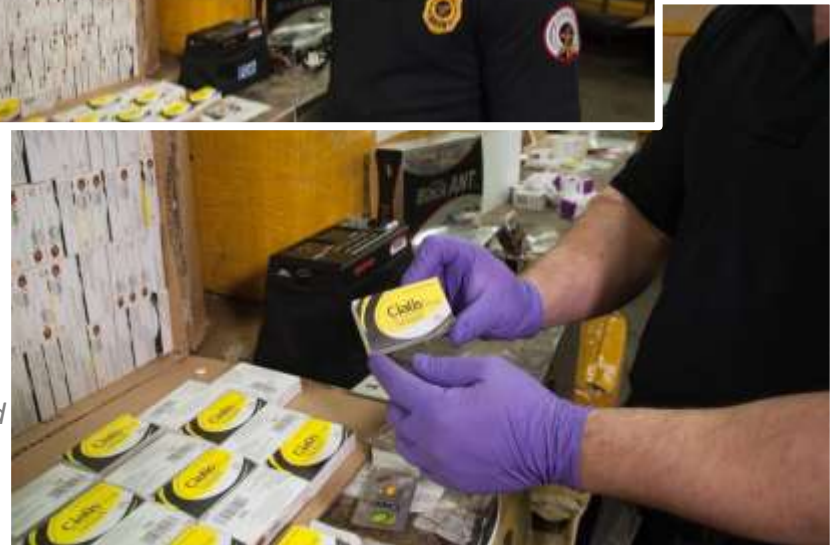
Single mail parcel containing appx. 3,200-4,000 tablets of suspected counterfeit Cialis after being screened using the CD3 Counterfeit Detector.