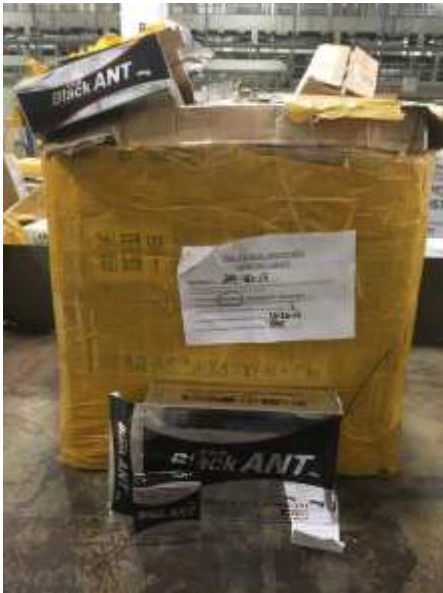
Sexual enhancement product with undeclared drug ingredient