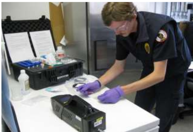
Preparing test sample for ion mobility spectrometer analysis