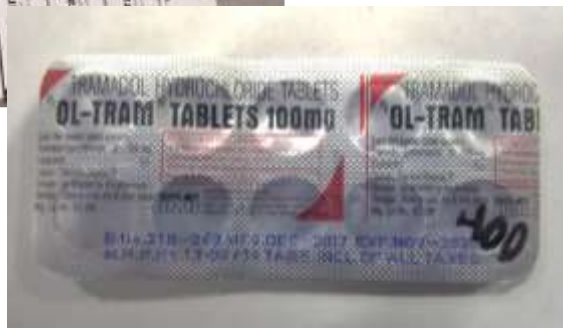
Foreign, unapproved version of tramadol