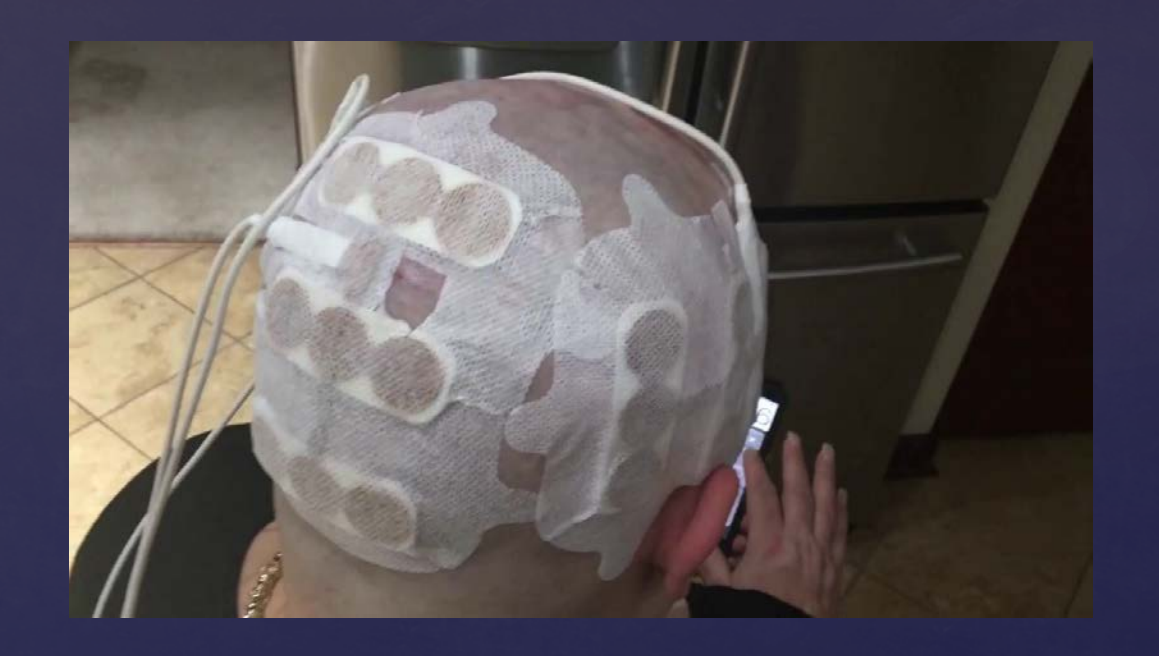
Optune® - for treatment of a type of brain cancer