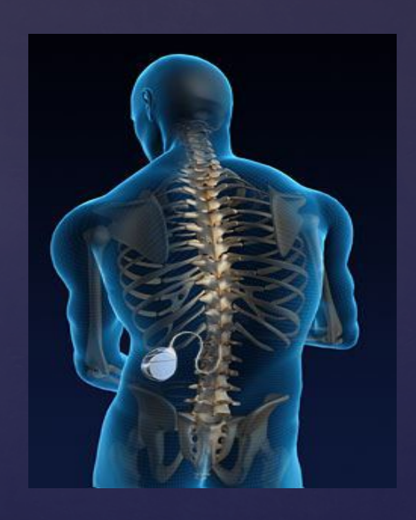
Intrathecal pain pumps