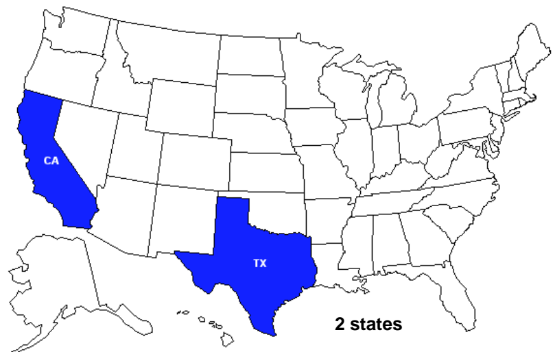
Figure 1. Medical Device Contract States (2016-2017)