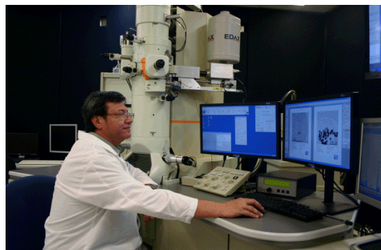
NanoCore scientist conducting electron microscopy.

The biological impacts of nanomaterials are virtually unknown, especially if the material has the potential to be migrated to food and ingested. In collaboration with the Arkansas Research Alliance 78 , NCTR developed a model to test the effects of graphene on intestinal microbiota living in the human gut, also called the human microbiome. The study, which continues in FY 2017, is evaluating graphene-induced toxicity to the intestinal microbiota and the gut-associated immune response. Early results suggest no major effects to growth of gut bacteria belonging to human microbiome and no major effects to intestinal permeability. Having access to science-based information like this is critical for FDA to regulate nanomaterial-containing products to ensure that they are safe for humans.