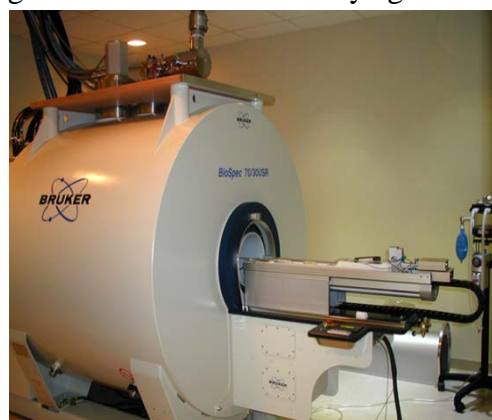
Preclinical MRI machine - one of the pieces of equipment used in the NCTR Bio-Imaging Facility.

NCTR, in collaboration with Huntington Medical Research Institute, has developed a method to improve the use of MRS scans to predict or diagnose medical abnormalities without the need for biopsies. The method is being used to identify Alzheimer's, dementia, and mild cognitive impairment.