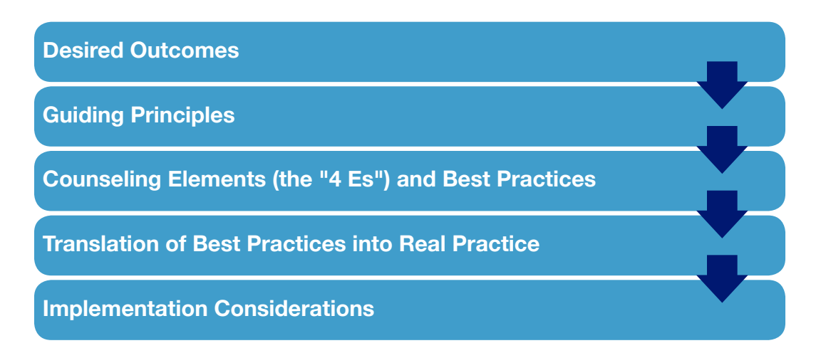
Figure 1: A Framework for Benefit-Risk Counseling to Patients About Drugs with a REMS

FDA developed this framework for counseling patients about potential benefits and risks when the treatment option being considered, started, or maintained includes a drug that has a REMS. The framework (see Figure 1) describes a set of desired outcomes from the implementation of effective counseling by various stakeholders and guiding principles and best practices for achieving those outcomes. The framework recognizes and introduces potential approaches to translating the framework for incorporation into the treatment process, as well as other implementation considerations.