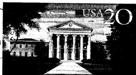
The Lyceum, University of Mississippi, Oxford